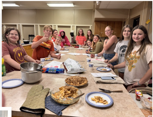
KIDDOS MAKING APPLE PIES AT FALL FEST