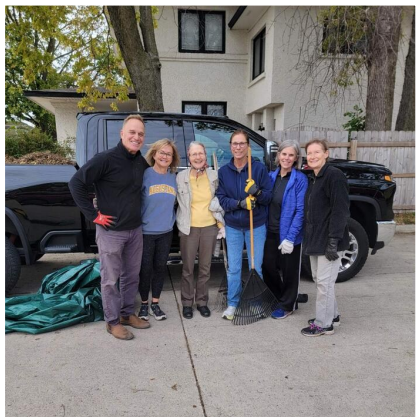
VOLUNTEERS FOR GOD'S WORK. OUR HANDS.