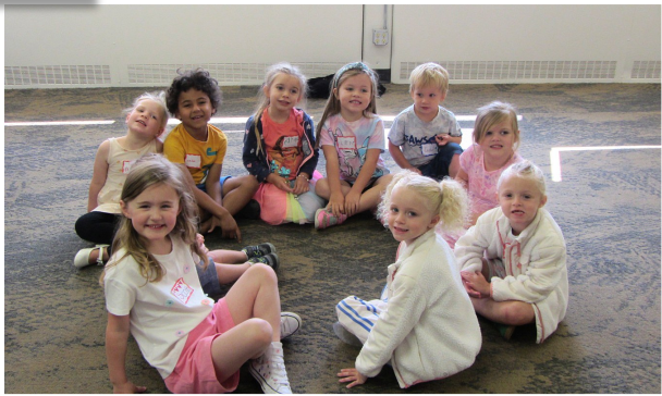
VACATION BIBLE SCHOOL KIDDOS