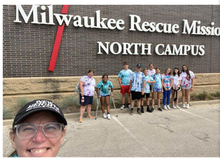
YOUTH SERVICE TRIP TO MILWAUKEE