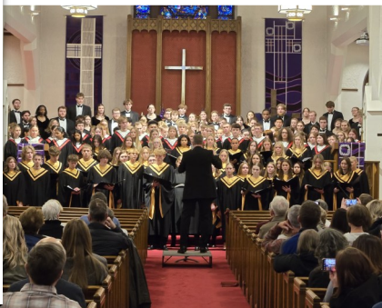
AREA HIGH SCHOOL CHOIRS SING