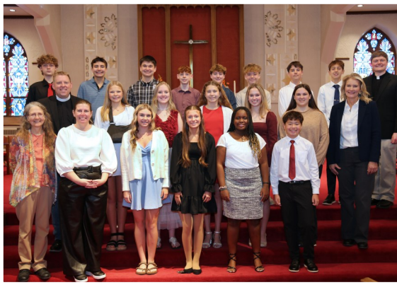
CONFIRMATION CLASS 2025

Trinity's Youth had a wonderful year learning about Jesus, participating in fellowship, Confirmation, enjoying special events, and Sunday School!