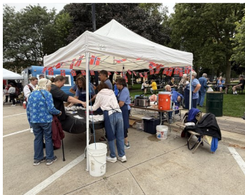
ANNUAL ETHNIC FAIR