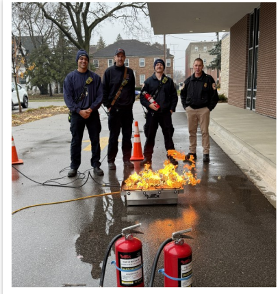
FIRE EXTINGUISHER TRAINING IN THE PARKING LOT