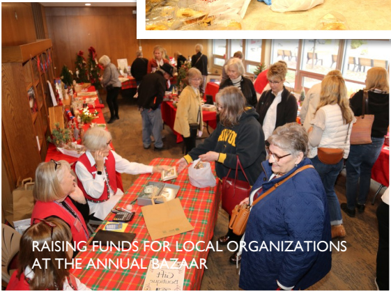
RAISING FUNDS FOR LOCAL ORGANIZATIONS AT THE ANNUAL BAZAAR