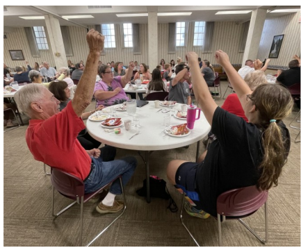
WEDNESDAY NIGHT ALIVE FUN!