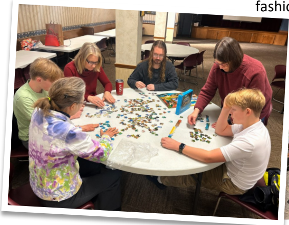
TRINITY'S FIRST PUZZLE PALOOZA PUZZLE RACE!

Trinity's always got something going on! The happenings of 2025 included events of faith formation, fellowship, exercise, cooking, learning, and good old-fashioned fun!