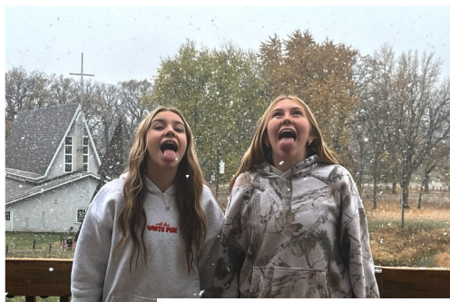
KIDS AT RIVERSIDE RE- CHARGE ENJOYING THE SNOW (ABOVE)