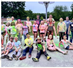
COLOR WAR AND GAMES AT WEST PARK