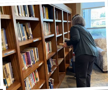
TRINITY'S LIBRARY REMODELED