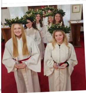
TRINITY'S SUNDAY SCHOOL PROGRAM FEATURING OUR SANTA LUCIA GIRLS