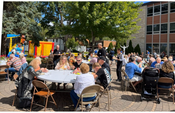
TRINITY HAS COMMUNITY BLOCK PARTY TO WELCOME NEIGHBORS