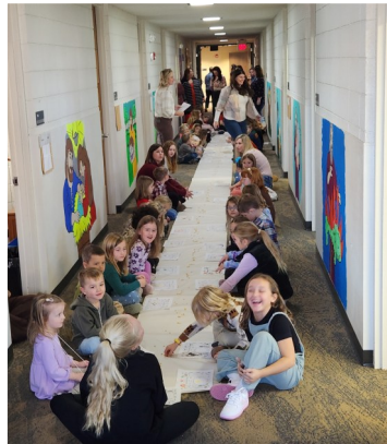
SUNDAY SCHOOL THANKS- GIVING (RIGHT)