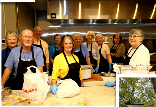
FOLKS IN THE KITCHEN HELPING WITH MEALS FOR THE BAZAAR