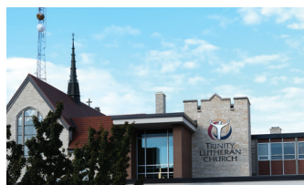
Front Page: East entrance of the building

The Trinity Connection informs the members of Trinity Lutheran Church and the people of north Iowa about the church's mission, and people, helping them to grow in faith and commitment to Jesus Christ.