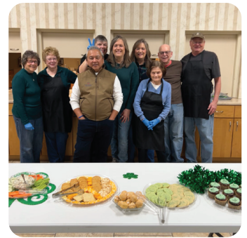
ADULT MINISTRIES CABINET