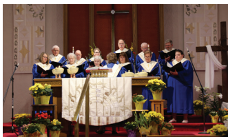
Front Page: Trinity's Choir sings on Easter Sunday

The Trinity Connection informs the members of Trinity Lutheran Church and the people of north Iowa about the church's mission, and people, helping them to grow in faith and commitment to Jesus Christ.