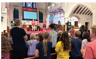
Front Page: Trinity's Vacation Bible School in the Sanctuary

The Trinity Connection informs the members of Trinity Lutheran Church and the people of north Iowa about the church's mission, and people, helping them to grow in faith and commitment to Jesus Christ.